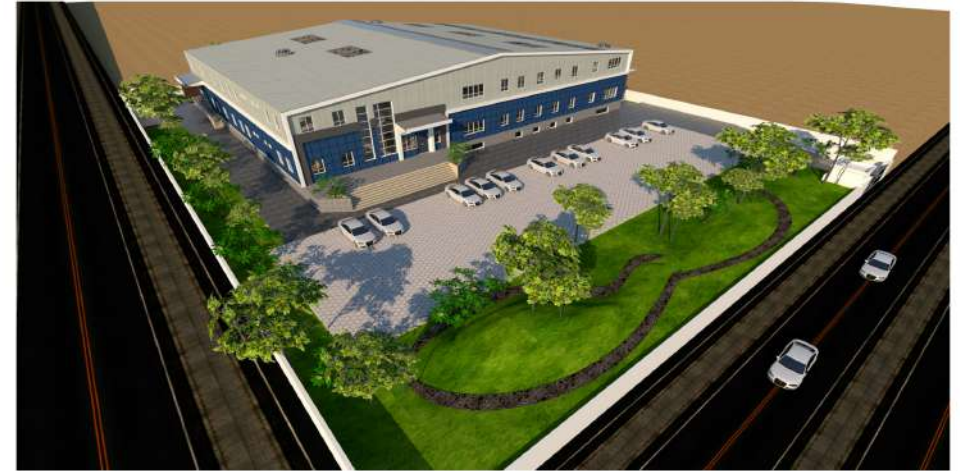
Industrial unit for M/S G.P.P.L. Industries, Penukonda, Distt. Anantpur, Andhra Pradesh.