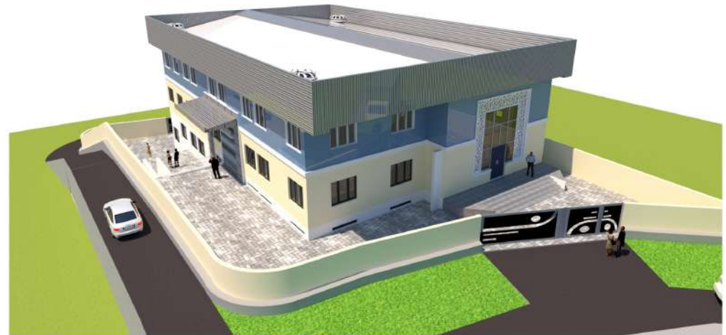
Industrial unit for M/S Alpha Precisions Products Pvt. Ltd., at RICCO, Urban state Industrial area, Dholpur, Rajasthan.