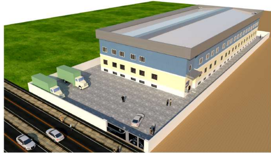
Industrial unit for M/S K.G.P.L. Industries, Kasuya, Yokohama Group at A22, Meerut Road Industrial area, Ghaziabad.