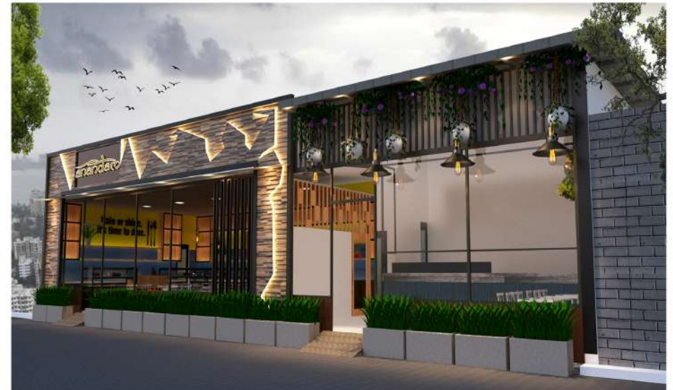
Commercial complex for M/S Aanandam, Patel Nagar Dehradun