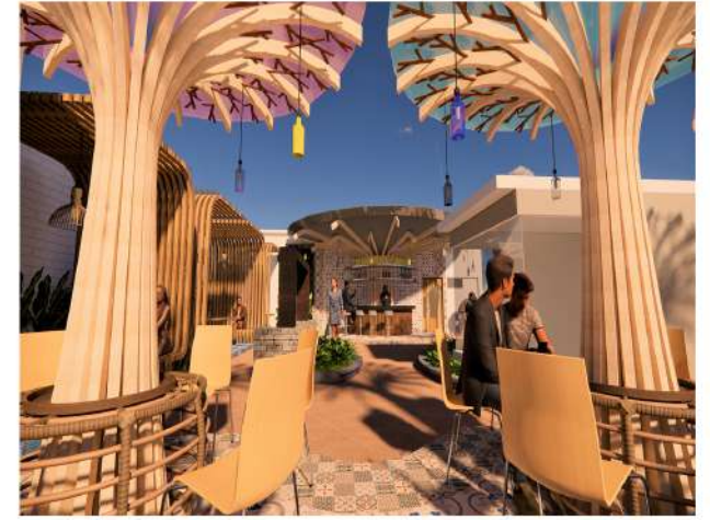
Restaurant cum Bristo, Hotel project for M/S Chanchal Sweets & Beverages, Haridwar road, Dharampur, Dehradun.