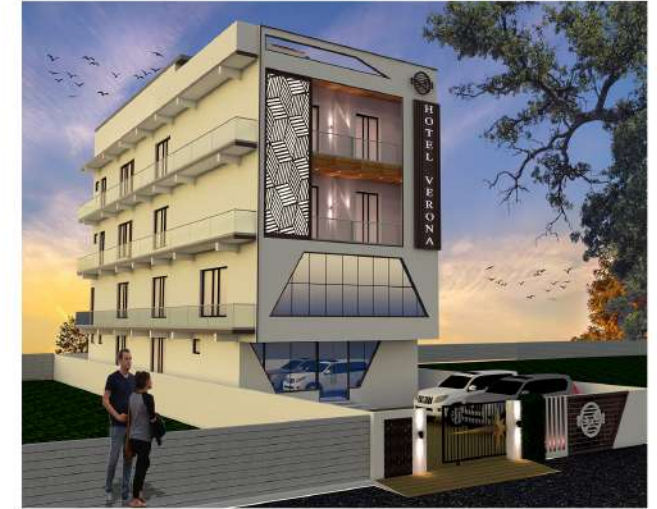
4 Star category hotel Canopy Green's, near Shivalik International School, Saharanpur road, Dehradun.