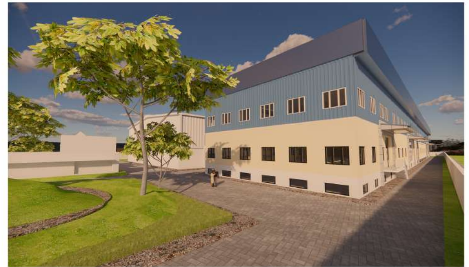
Industrial unit for M/S K.G.P.L. Industries, Sidcul, Distt. Sitarganj, Uttrakhand.