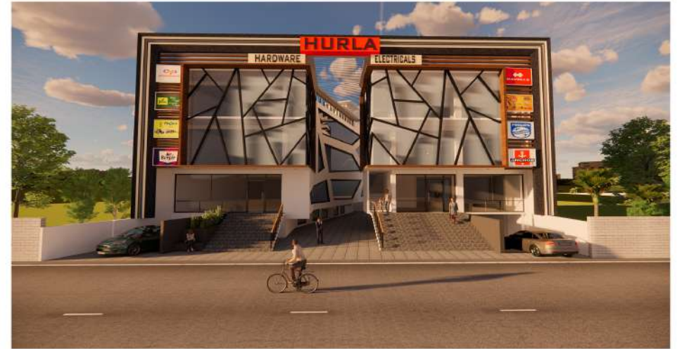
Commercial complex for M/S Hurla hardwares, Haridwar Road, Dharampur, Dehradun.