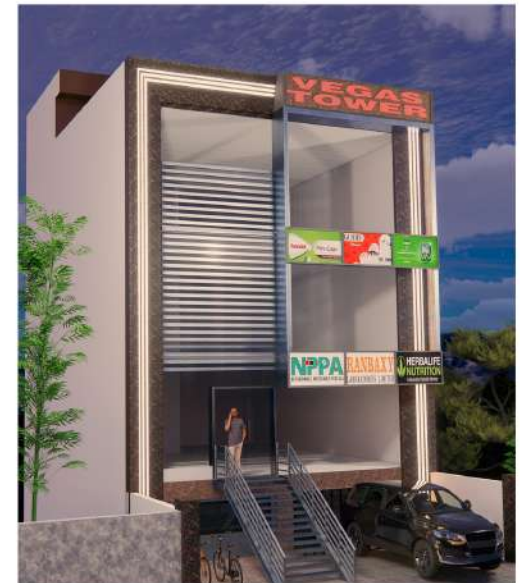
Shiva Pharmaceutical at New cantt road, Dehradun.